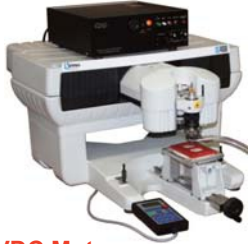
24VDC Motor IS 400