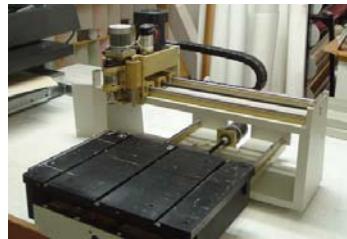
HSquare 2412 2518