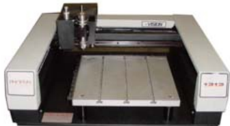
24VDC Motor Vision 1212

All of these capabilities for $4,295* Plugin RETROFIT * add $200 if existing spindle motor is 24vdc